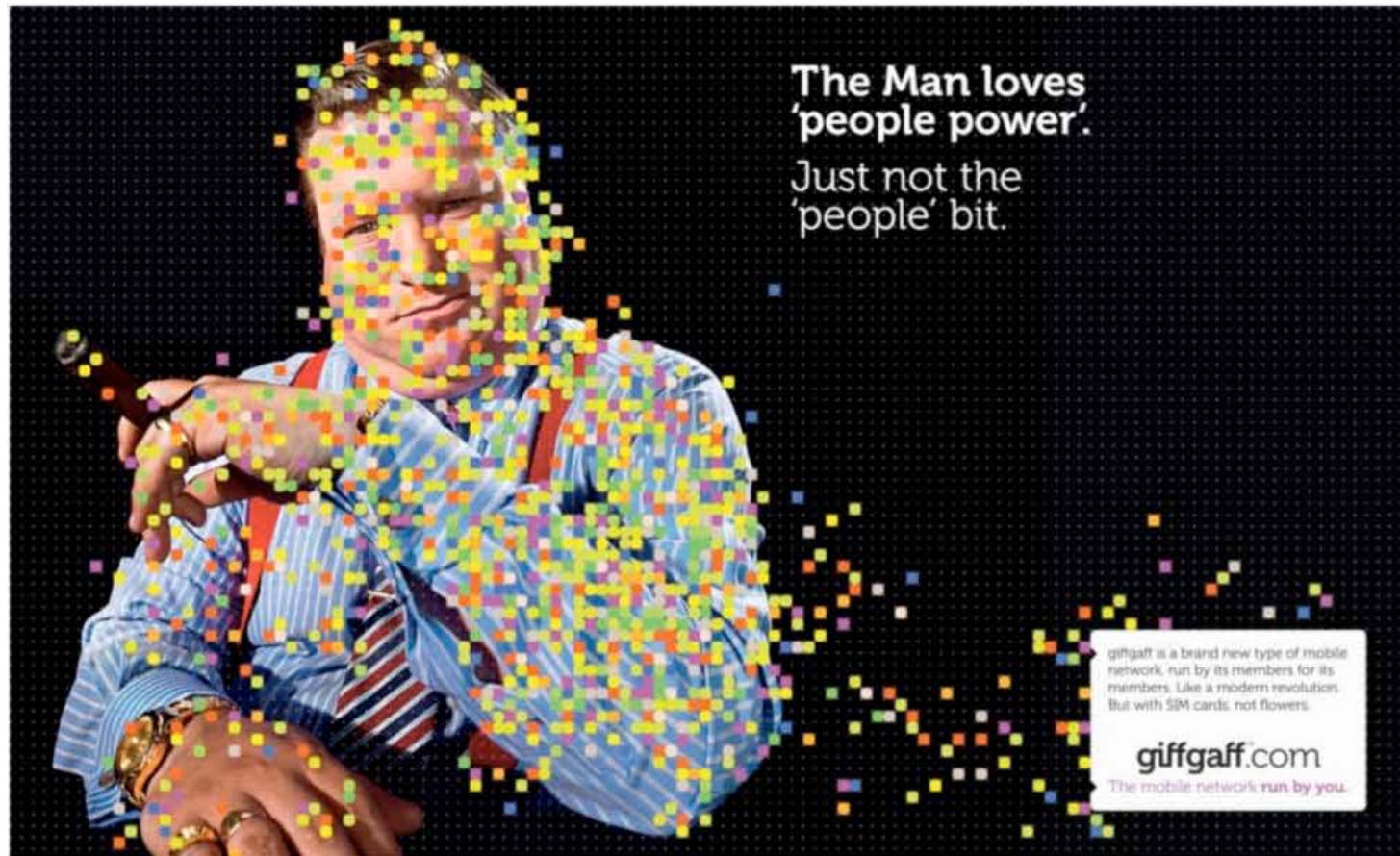
Figure 3 'The Man' integrated campaign

For the first time, too, the brand was showcased offline as well as online to help validate the service in the eyes of this broader audience. The integrated campaign ran across digital outdoor, national press, online display and social media. It was based on the concept of 'The Man', a representation of the 'establishment' way of doing the sort of things that giffgaff and its customers were against. The caricature tapped into the cultural rage against bankers and fat cats in the wake of the recession and oil spills (Figure 3).