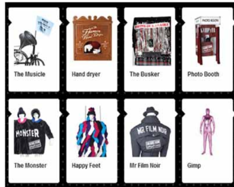
Figure 2. 'VIG' SIM card campaign

Consumers were incentivised to take part with the offer of a VIG (very important giffgaffer) SIM card that offered free calls, texts and data for a year. To promote sharing and creativity there were five prizes of £5,000 awarded to the community-nominated winner of categories such as 'most viewed', 'funniest' and so on (Figure 2).